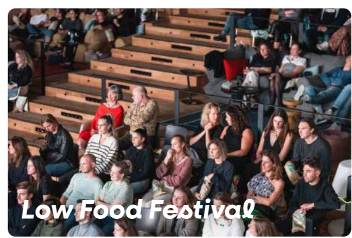
Low Food Festival

Takes place yearly and is the place to be inspired by renowned chefs and food experts from both local and international backgrounds, as we delve into the art of making smart, sustainable, and delectable choices in the kitchen. The festival always contains an array of activities, including: culinary workshops, tantalising tastings, enlightening talk shows, food photography, food films, and a special program for kids.