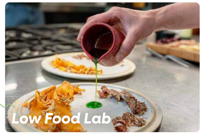
Low Food Lab

In the Low Food Labs This is a collaboration with Flevo Campus, which we bring together culinary knowledge, agricultural knowledge, and product development together. The Labs are where chefs develop new products, preparation methods, and techniques that contribute to a fairer, more diverse, healthier, and/or more sustainable eating habits. In the Labs, they work on food issues for which a culinary solution must be found.