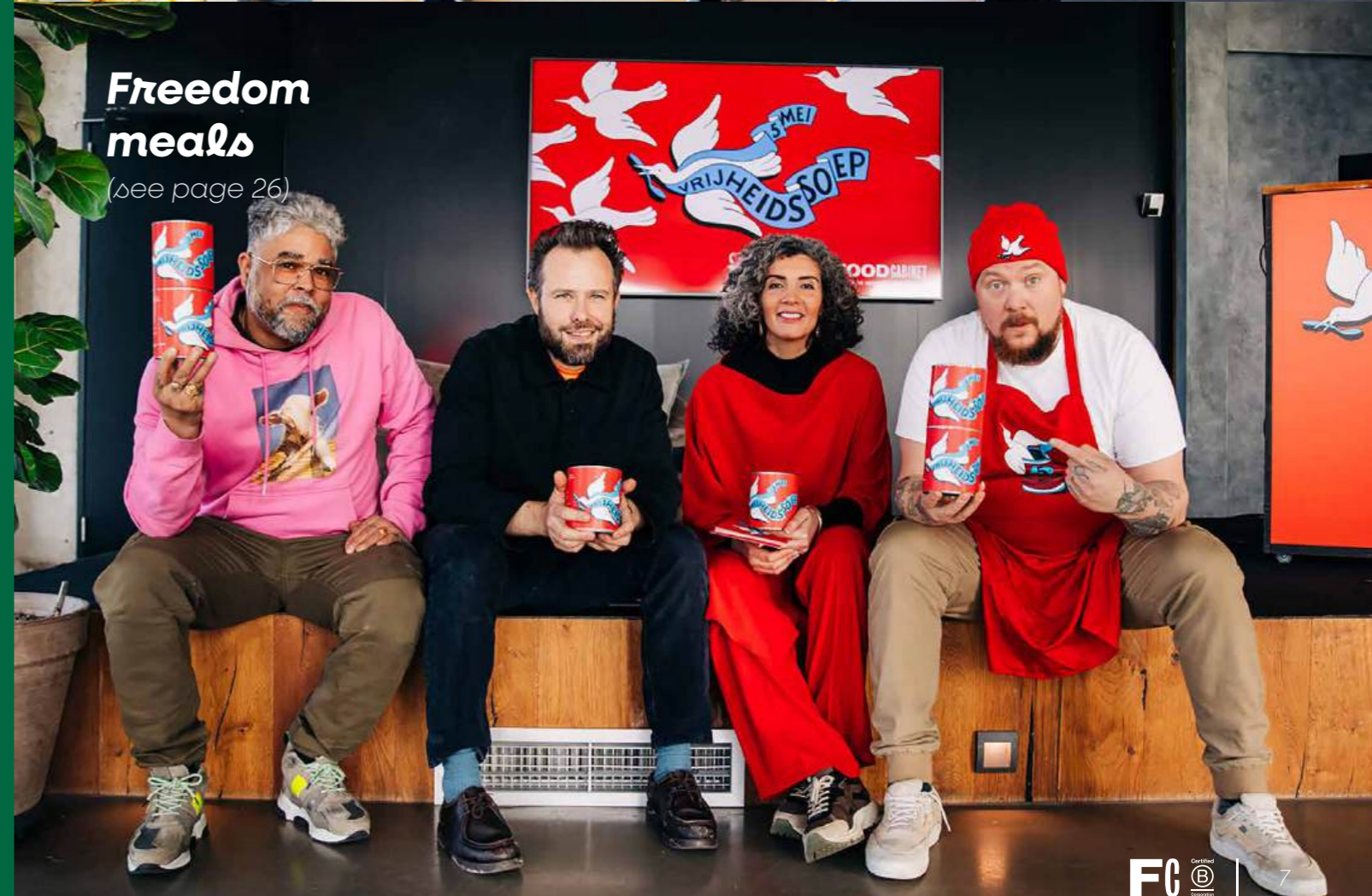
Freedom meals (see page 26)